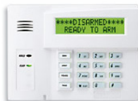
Example of Basic Monitoring Keypad Console

The Door Switch is a patented design. (Patent No. 7,466,237)